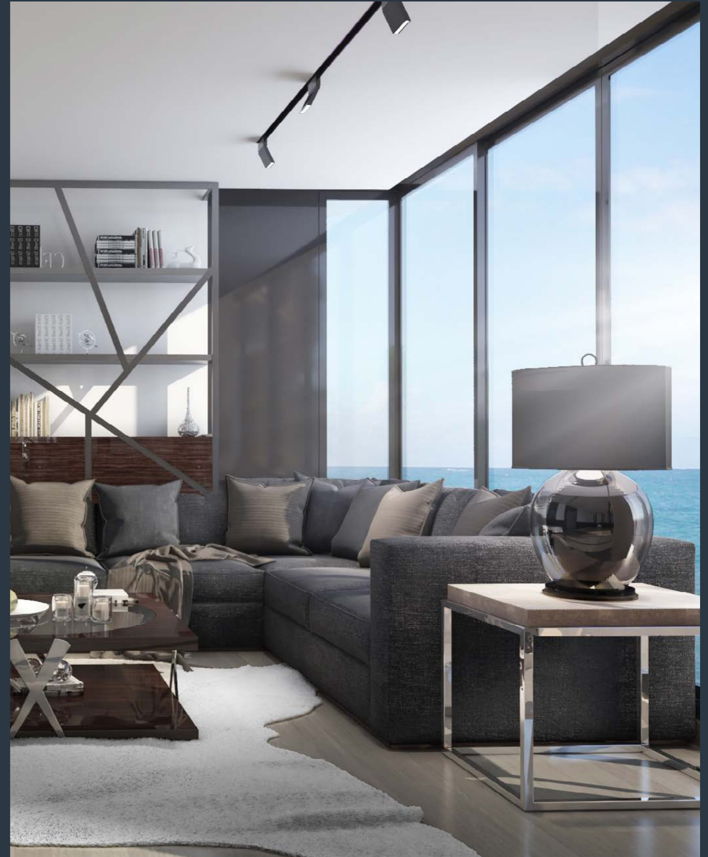
Luxury 3 Master Bedroom Apartments with Sea and Mountain Panoramas